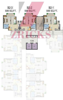
TOWER - SUN 5